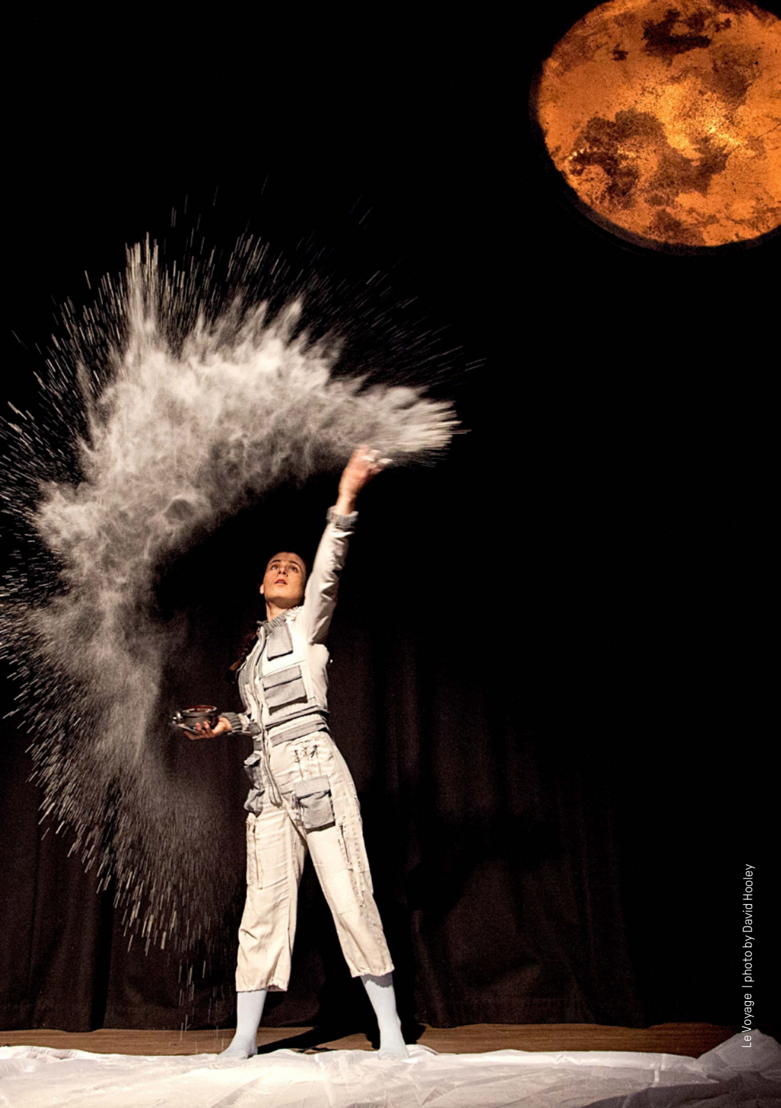
Le Voyage